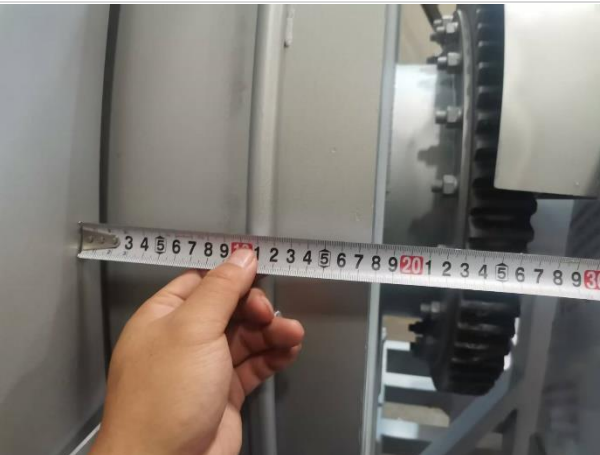
Fig 7 Dimension check