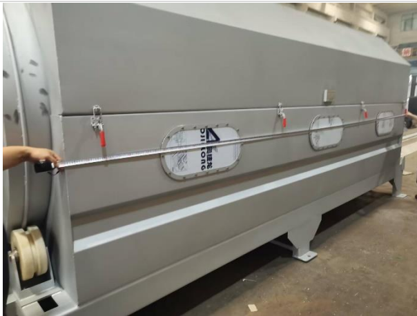
Fig 9 Dimension check