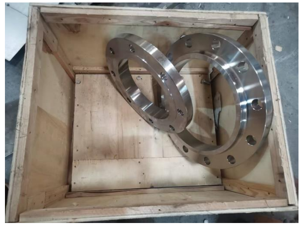
Fig 4 Companion flange