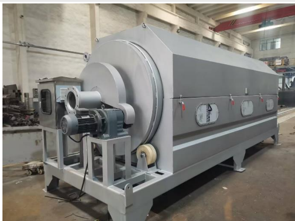
Fig 1 Rotary Drum Screen (JXN-1500)