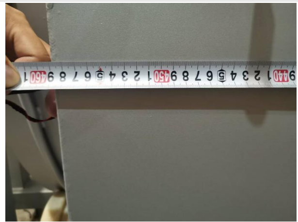
Fig 10 Dimension check