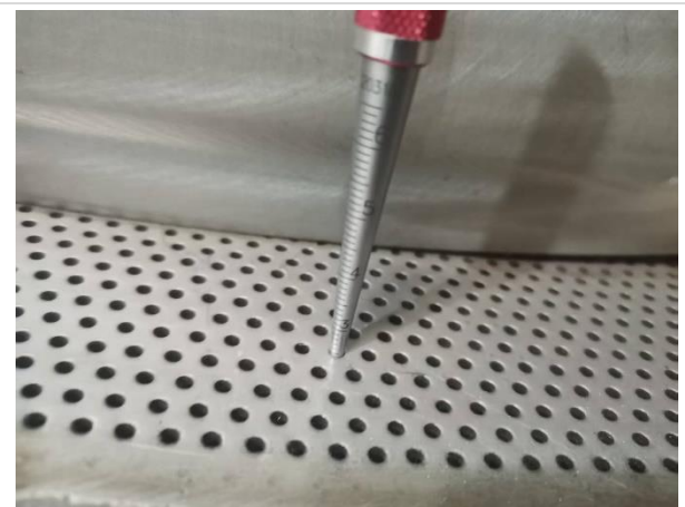
Fig 12 Perforated Mesh Dimension check