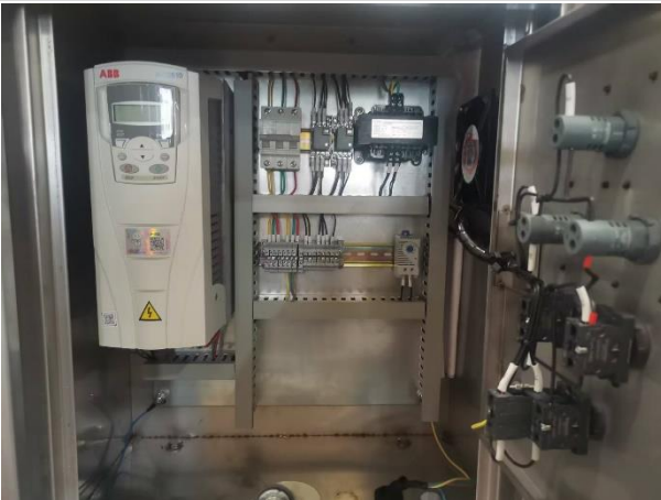
Fig 5 Electronic control box inside Visual check