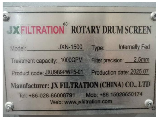
Fig 2 Nameplate