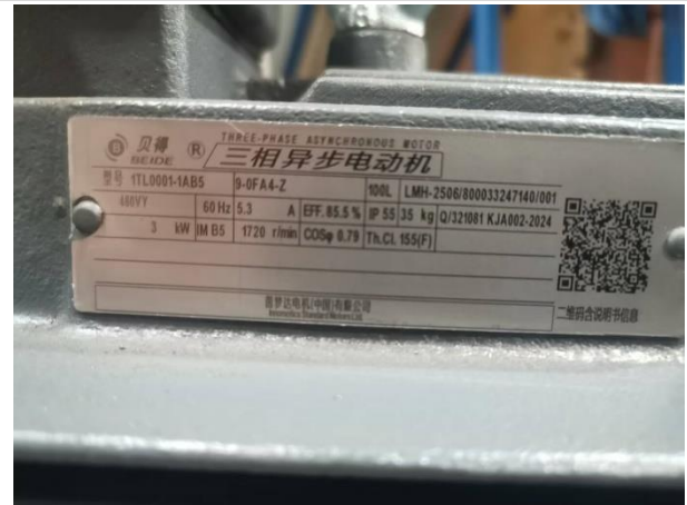
Fig 6 Motor Nameplate check