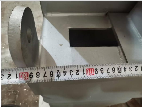
Fig 11 Dimension check