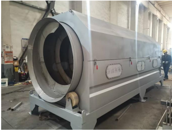
Fig 3 Rotary Drum Screen (JXN-1500)