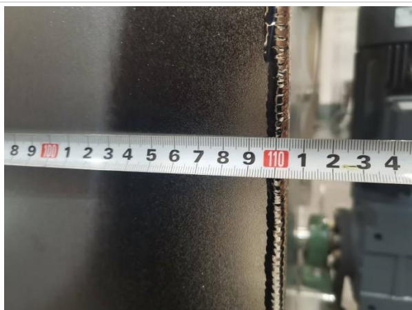
Fig 13 Check overall dimensions