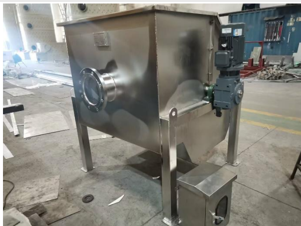
Fig 1 Externally-fed Rotary Drum Screen (JX-LW-800)