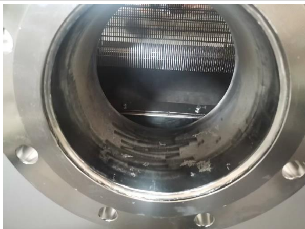
Fig 7 Color difference on the electroplated surface