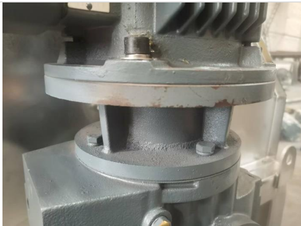
Fig 9 The paint surface is slightly damaged