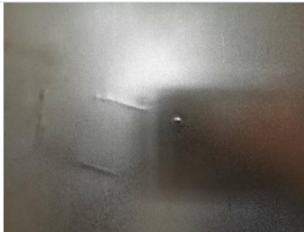
Fig 10 Weld beads on the outer surface