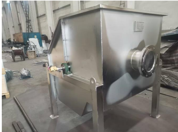
Fig 6 Color difference on the electroplated surface