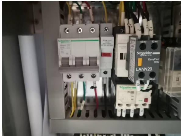
Fig 4 Electrical components of control box (Schneider)