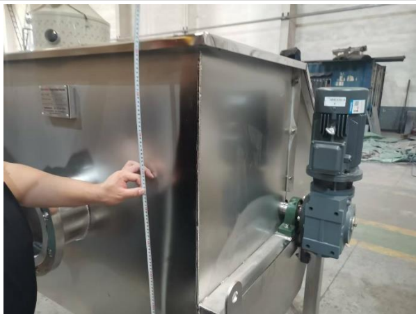
Fig 11 Check overall dimensions