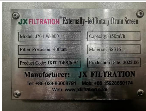
Fig 2 Nameplate (JX-LW-800)