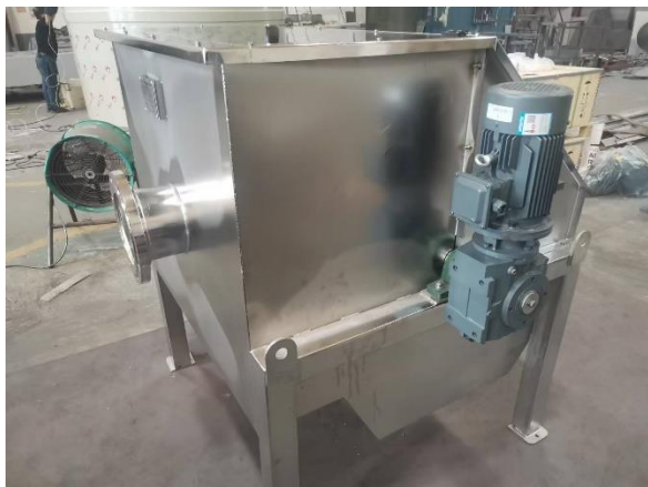
Fig 5 Outside Visual check