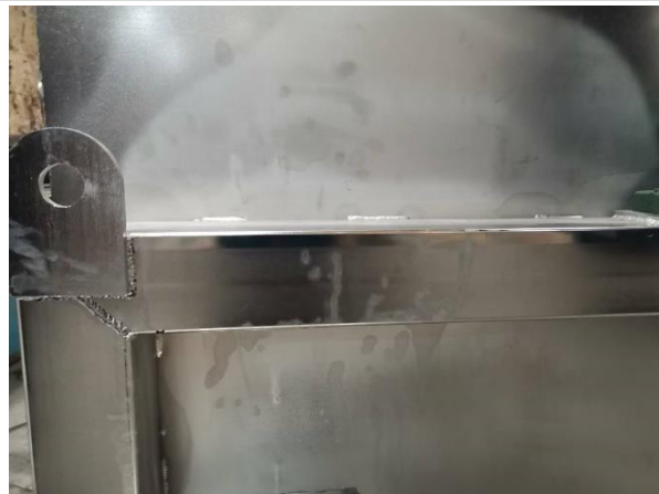
Fig 8 Color difference on the electroplated surface