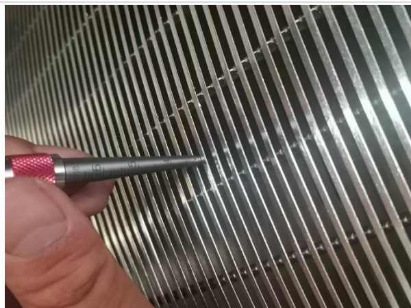
Fig 14 Check dimensions